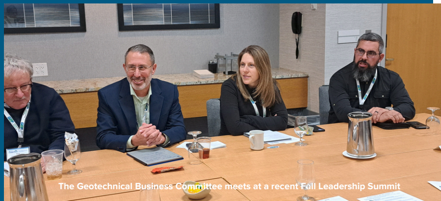
The Geotechnical Business Committee meets at a recent Fall Leadership Summit