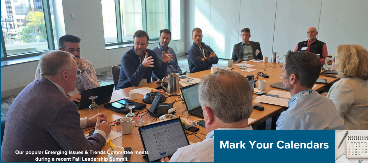
Our popular Emerging Issues & Trends Committee meets during a recent Fall Leadership Summit.